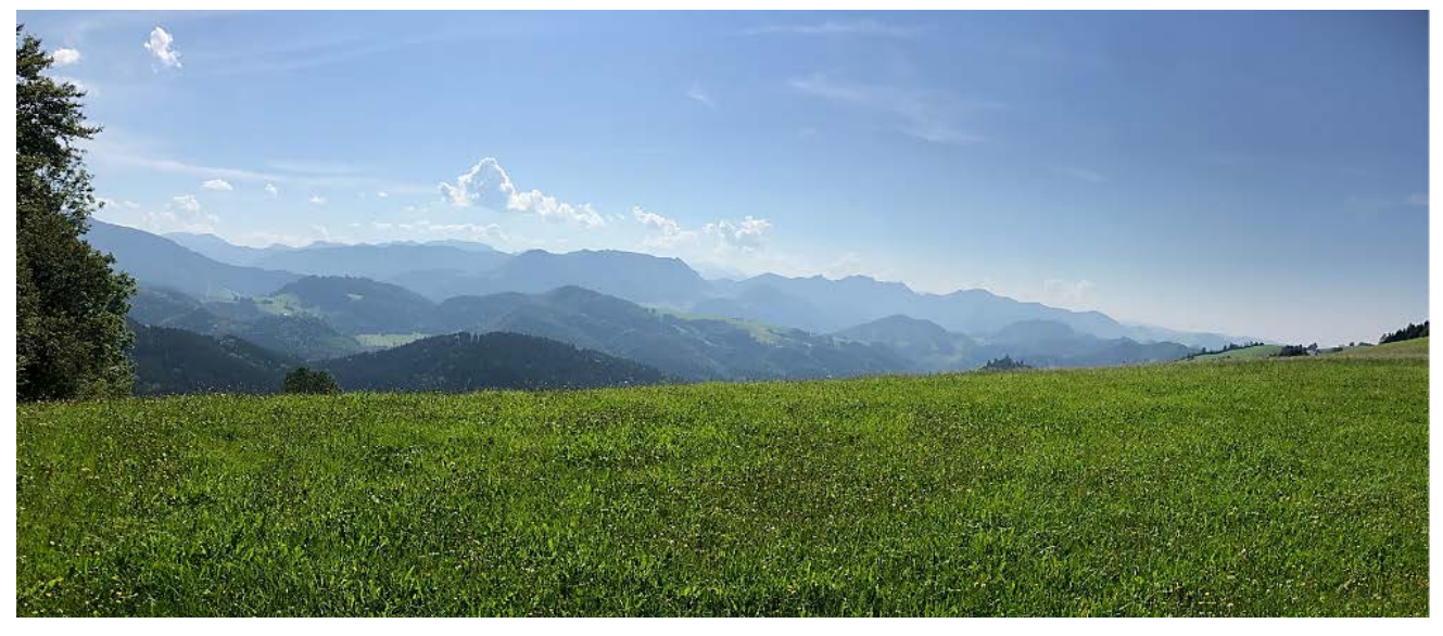
View from North towards the Welchau anticline mountains at the back of the image

The Environmental Sustainability project will be conducted by a group of experts funded by ADX to investigate best practice for sustainable development in the greater Welchau prospect area with a view to minimising environmental impact while maximising the short as well as long term social and economic benefits of any potential energy development. Importantly the goals of the Environmental Sustainability project are in line with FFG objectives of enhancing the innovative performance of the Austrian economy.